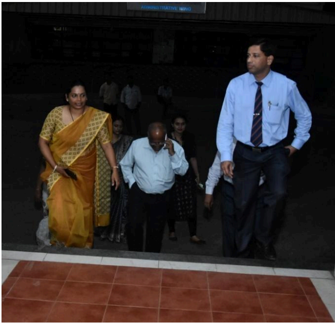
ANO escorting Dignitaries